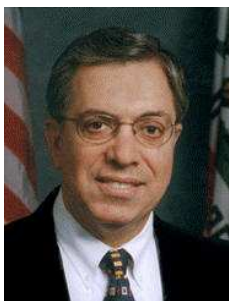
Many politicians, such as California State Senator Chuck Poochigian (above), use online social networks such as Myspace and Facebook for campaigning

With the growing popularity of social networking websites, such as MySpace and Facebook, politicians are beginning to see new opportunities. They are taking grassroots campaigning to the web hoping to gain the support and interest of young voters. Arkansas Rep. Marion Berry and California state Sen. Chuck Poochigian already have profiles on MySpace and more are expected to follow.