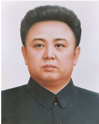
North Korean leader Kim Jong Il