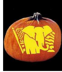
Happy Halloween, Republicans!