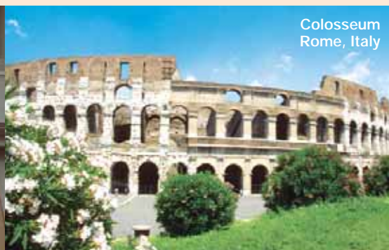
Colosseum Rome, Italy