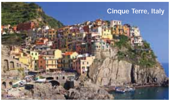
Cinque Terre, Italy