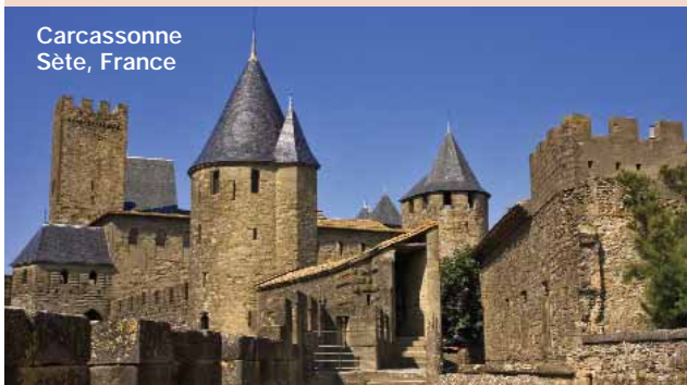
Carcassonne Sète, France